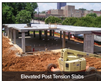
Elevated Post Tension Slabs