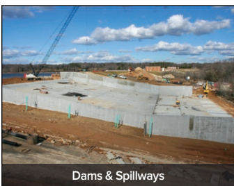
Dams & Spillways