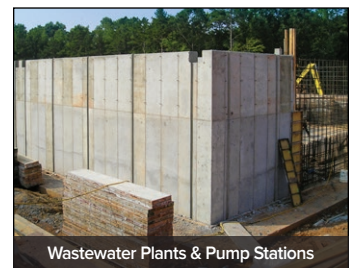
Wastewater Plants & Pump Stations